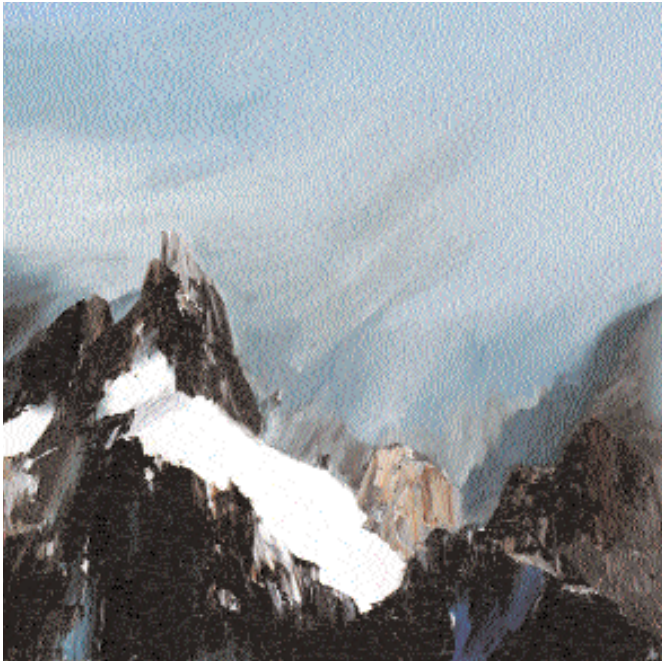
80 x 80 cms