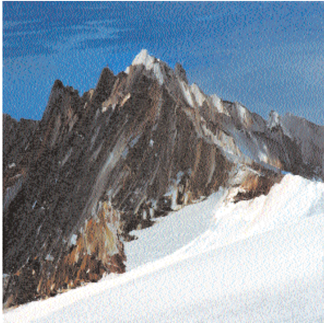
50 x 50 cms